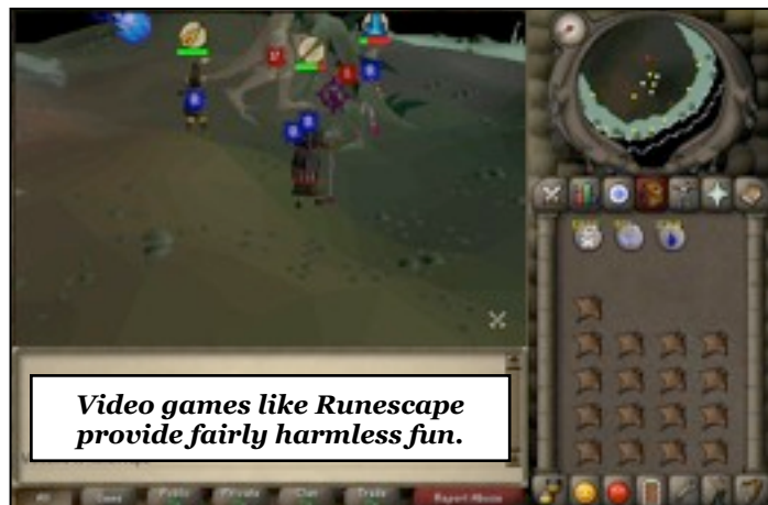
Video games like Runescape provide fairly harmless fun.

All in all, video games are not that harmful, if played in moderation.