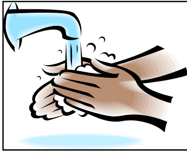
Washing your hands to keep them germ-free is one of the best ways to avoid illness.

I hope you find this helpful when you get sick, or when you think you are going to get sick soon. Better be safe than sorry!