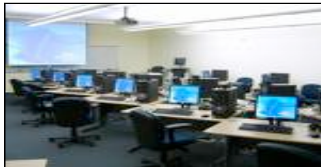
With nice equipment, people should never even consider bringing food and drinks into the labs.

happy, God will be happy, and other people will be happy. IF YOU COULD JUST DO THIS SIMPLE THING, EVERYBODY WILL BE HAPPY!