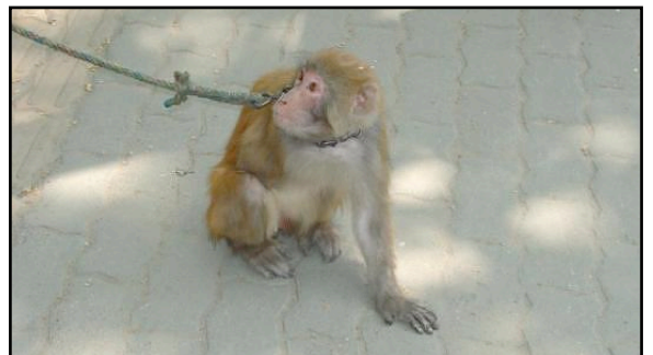
A photo of a one armed monkey. There is no photo of Dalat's One Armed Monkey.

Don't you hate it when the power goes out and the air conditioning stops running, forcing you to live in sweaty agony? Well, next time it happens, blame the one armed monkey! The one armed monkey (known to the Archer family as "Frank" although that isn't his name) has a habit of messing with the electrical wires around Dalat, consequently knocking out the power. Although he hasn't done it at the time of this article being written, he did it twice last year. Why is he one armed, you ask? The first time he messed with the fuses, he fried his arm!