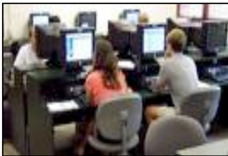
Students should do what they can to make computer labs quiet.

when they are playing games. I am one of them. When I was too noisy, somebody had to stop my big mouth. I was so embarrassed, so let's not try to get anyone else to do that. It is a MAJOR SOUND POLLUTION, not that I am the whole environment guy but we should still care and protect it. So in the computer lab we should all keep our voices down and not disturb anyone.