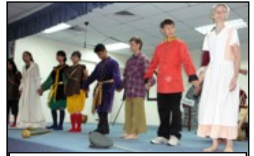
The cast takes a curtain call after a fine performance Friday.