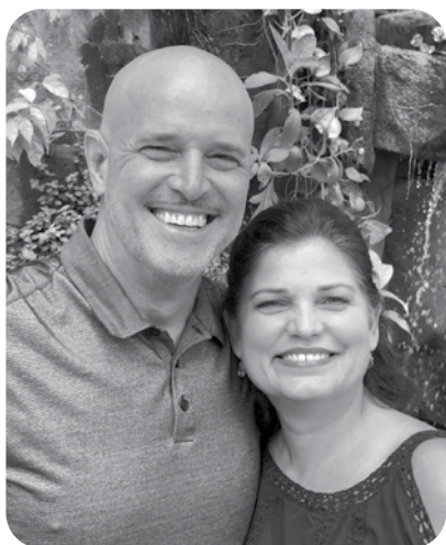
Keith and Rachelle Henderson Ziemer Dorm